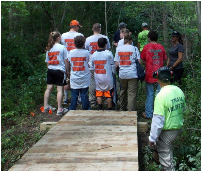
Volunteers from the Rochester School of the Deaf and RIT building a bridge at Ganondagan State Historic Site in Victor.