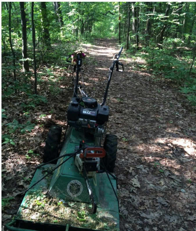
This mower needs an operator. Could it be you for an hour a week?