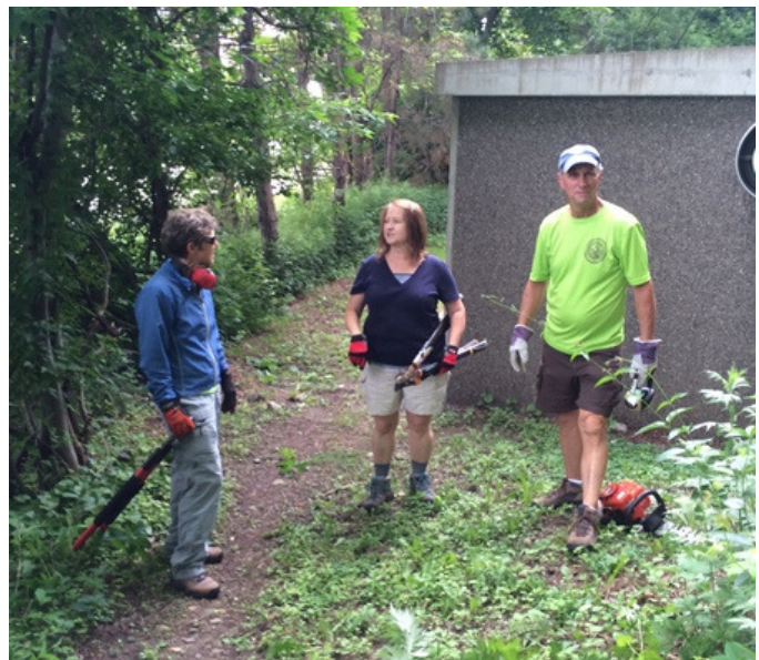
Some trail volunteers at the north end of the Seneca Trail. Can you join them for an hour a week?